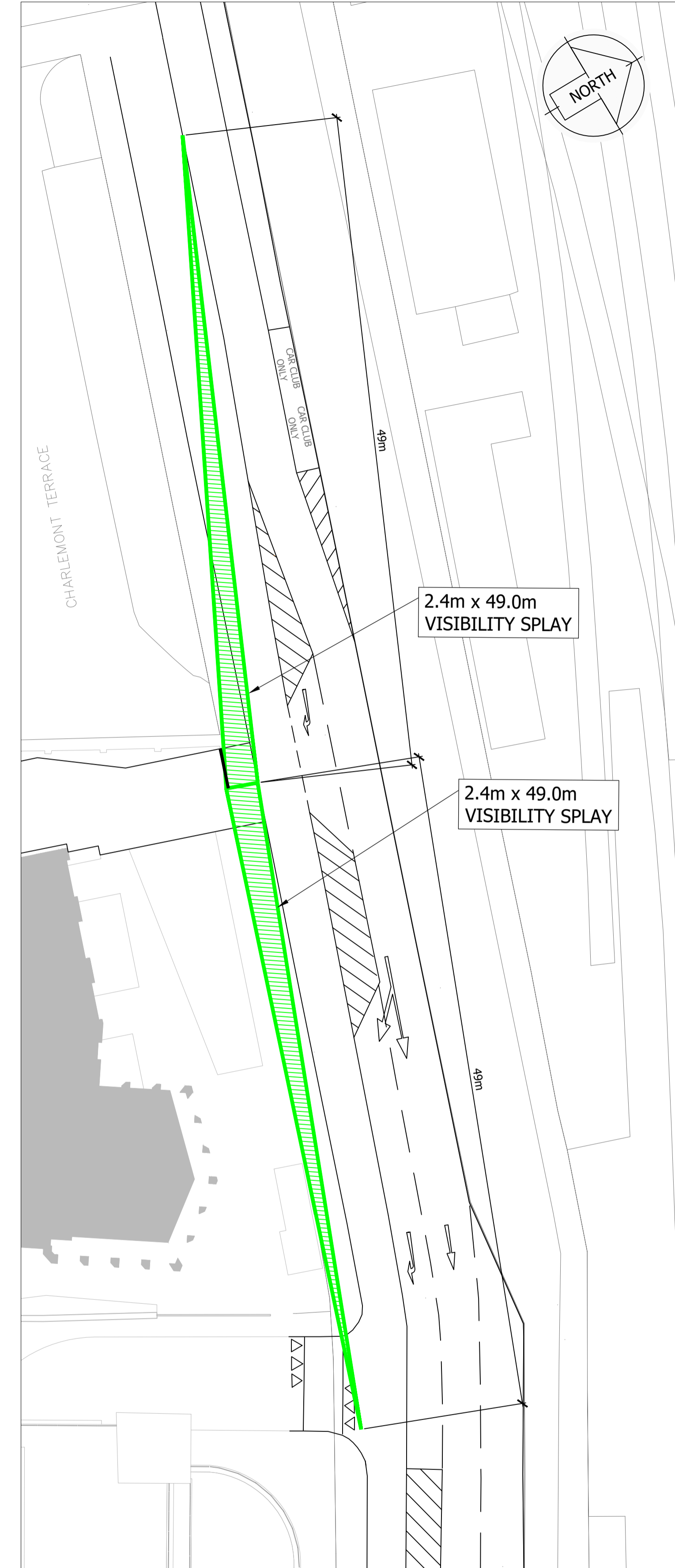
VISIBILITY SPYLA SCALE 1:250