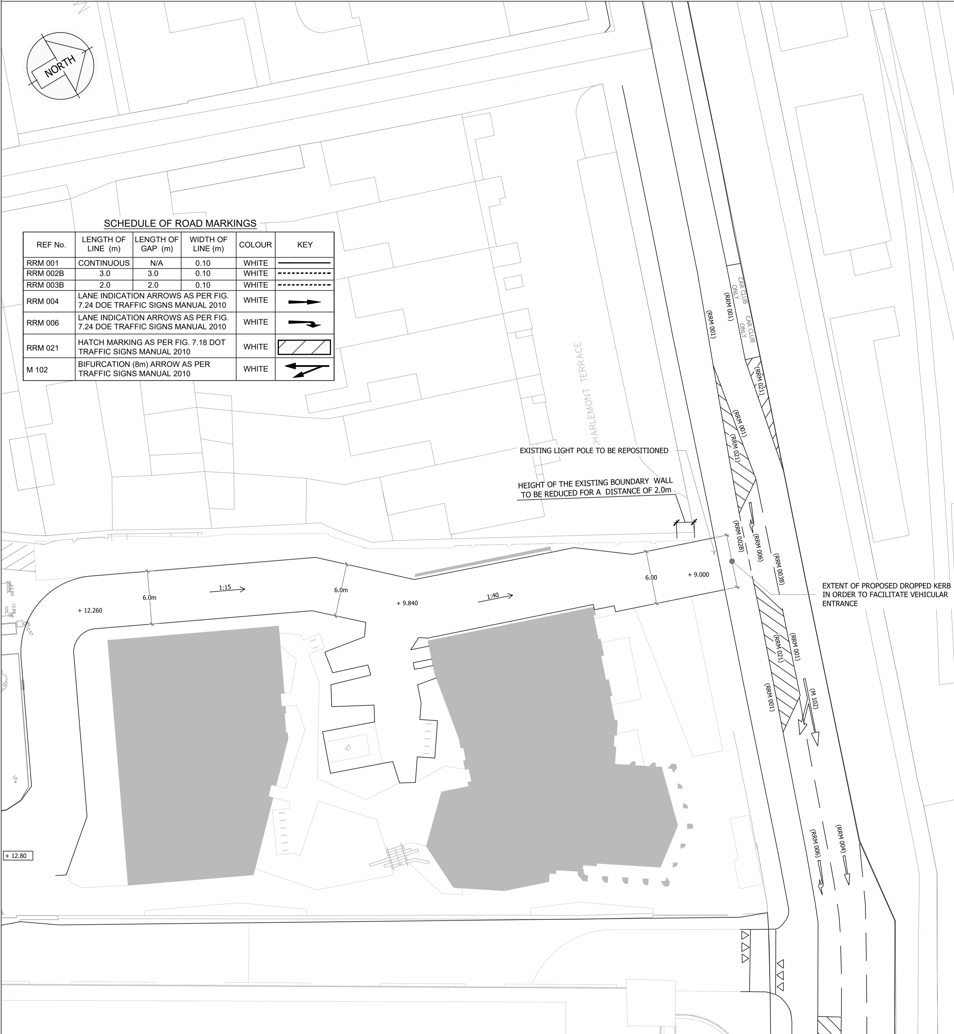
PROPOSED ROADS LAYOUT SCALE 1:250